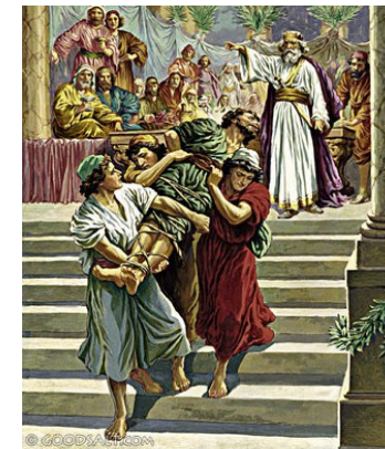
Parable of the Great Feast

14-та неділя по П'ятидесятниці. Голос 5 14th Sunday after Pentecost. Tone 5