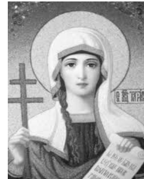
СВЯТА МУЧЕНИЦЯ ТАТІАНА