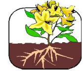
The Good Soil

What type of Soil are You? Is God Growing in Your Heart?